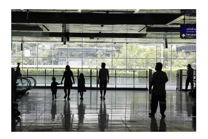
Bids for Bangkok's Bang Sue Grand station shop space 'soon'